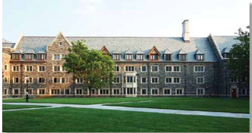
PROJECT: WHITMAN COLLEGE, PRINCETON, NJ

Whitman College at Princeton University, a new residential college hall which opened in the fall of 2007, was one of the largest, most technically demanding copper and slate roofing jobs undertaken by Bregenzer Brothers, Inc. Over 15 months they custom built and installed the 110,000 square foot slate and copper roof ranging over multiple buildings surrounding two large outdoor quadrangles. The job required 467 tons of slate and 30 tons of copper, and included exterior work over 104 dormers, flashings, a full network of drainage pipes and leader heads, plus other custom building details, large and small, from custom-fabricated chimney caps to handmade brass exterior finishing nuts.