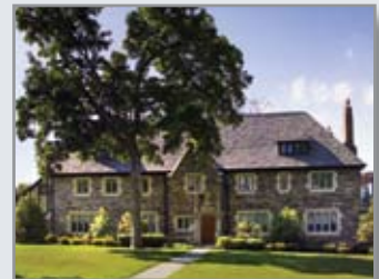
Dial Lodge, Prospect Street, Princeton