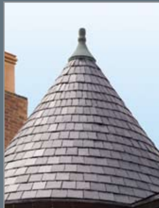
Cone Slate Roof - Dodd Hall, Princeton University

The Whitman College, Princeton University Witherspoon Hall, Princeton University Humanities Building, Princeton University Jones, Clio & Blair Hall, Princeton University Princeton University Press Princeton Theological Society, Miller Chapel St. Paul's Church, Princeton 185 Nassau Street, Princeton Dial Lodge, Prospect St., Princeton Town Topics Building, Princeton